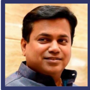
Shri. Uday Samant

Hon'ble Minister Higher & Technical Education