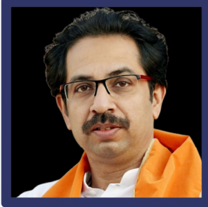
Shri. Uddhav Thackeray