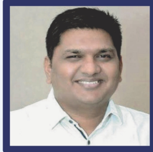
Shri. Prajakt Tanpure

Hon'ble Minister Higher & Technical Education